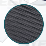
NITRILE FOAM COATED